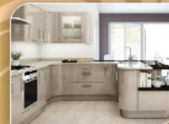
KITCHEN - WOMAN'S WORK SPACE - Blend of Proper Storage And Ease of Movement