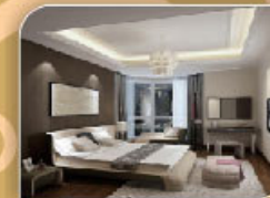
BEDROOM PERSONAL RETREAT Plush And Cozy