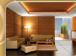
LIVING - Drawing cum Dining Luxurious, Stylish, Spacious Comfortable