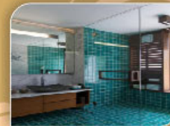
BATHROOM - REFRESH ZONE Designed For A Delightful Shower